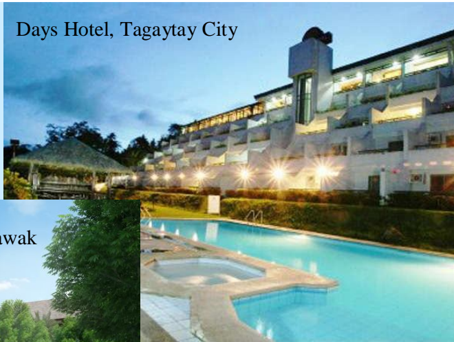
Days Hotel, Tagaytay City

Special Cebu Events: March 12-17, 2018 Bellavista Hotel, Lapu-Lapu City, Cebu