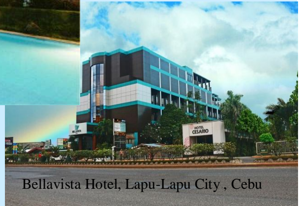
Bellavista Hotel, Lapu-Lapu City, Cebu

Register Now! (Please scan and email to: kaizen.system@yahoo.com ; jsv@kaizenmgtsys.com )